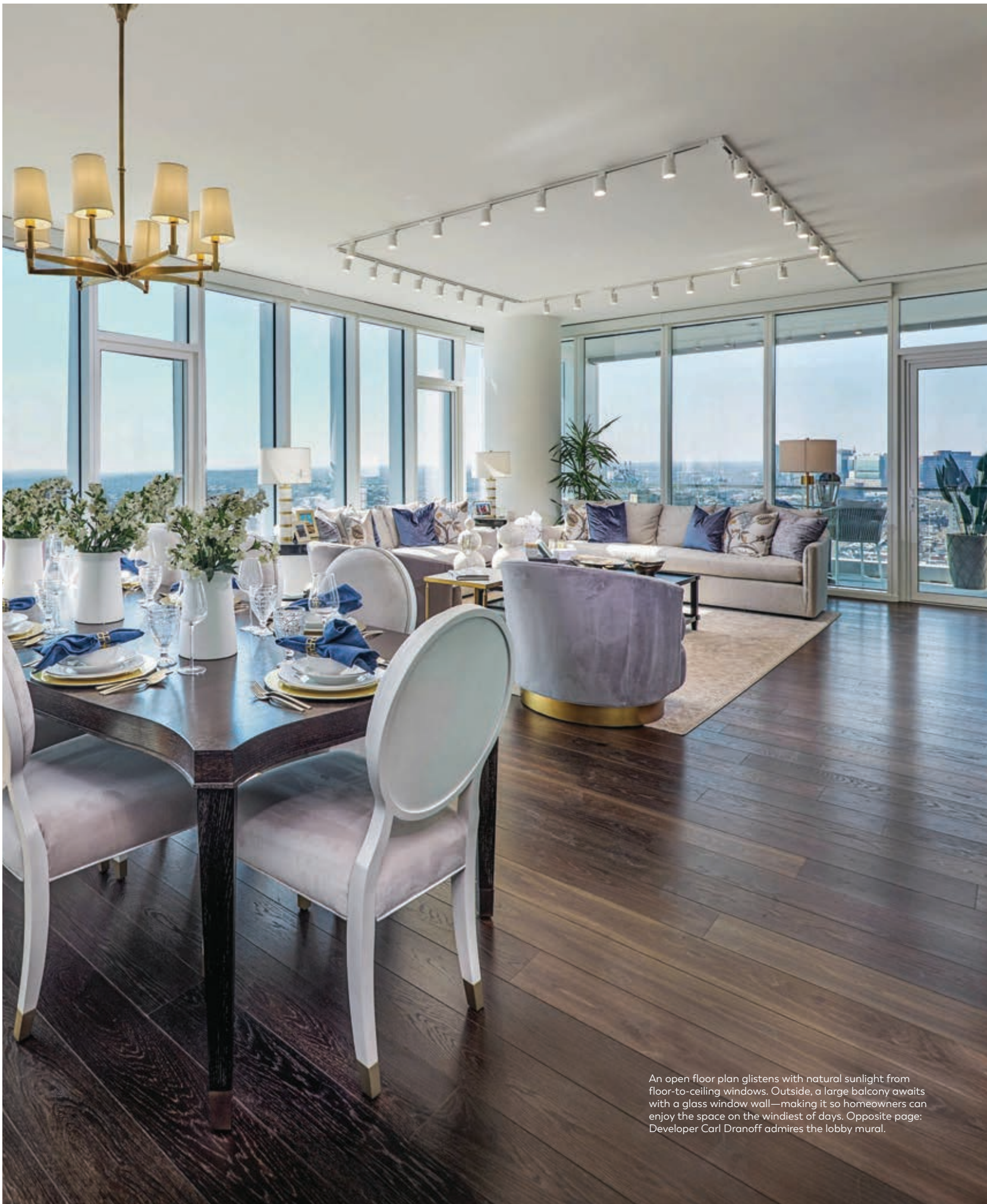
An open floor plan glistens with natural sunlight from floor-to-ceiling windows. Outside, a large balcony awaits with a glass window wall—making it so homeowners can enjoy the space on the windiest of days. Opposite page: Developer Carl Dranoff admires the lobby mural.